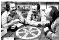
Trivial Pursuit co-creator dies