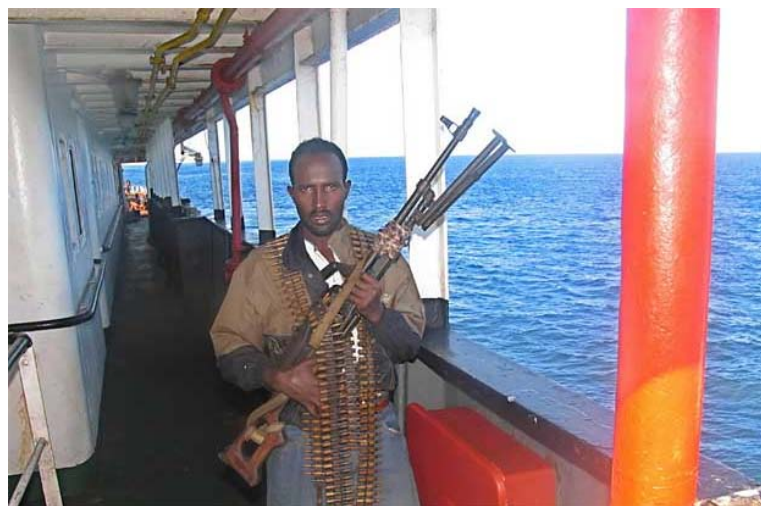
If your travels take you to parts of the world where people brandish automatic weaponry then you may consider purchasing kidnap insurance before you go.