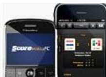
New mobile soccer app