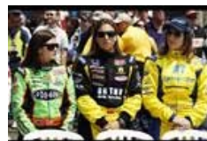
Women excel at Indy 500 event