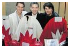
Canada bids for Henderson's jersey